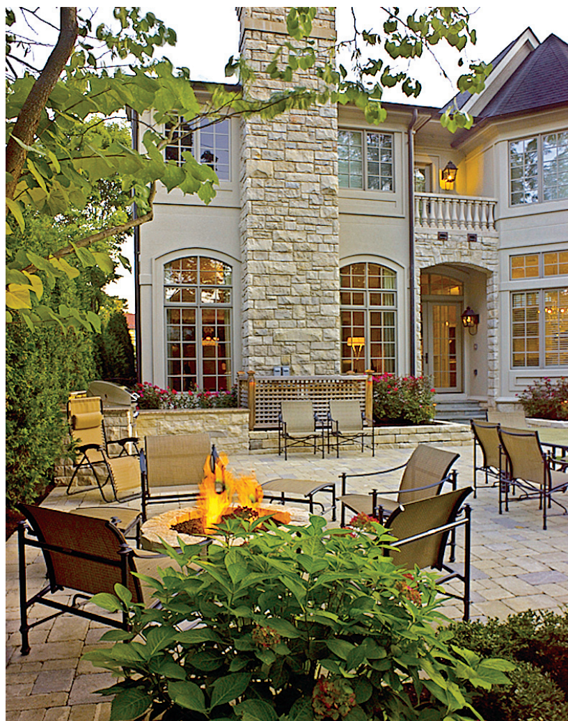
Large outdoor patio with fire pit and kitchen area, designed by Michael J. Dul & Associates.