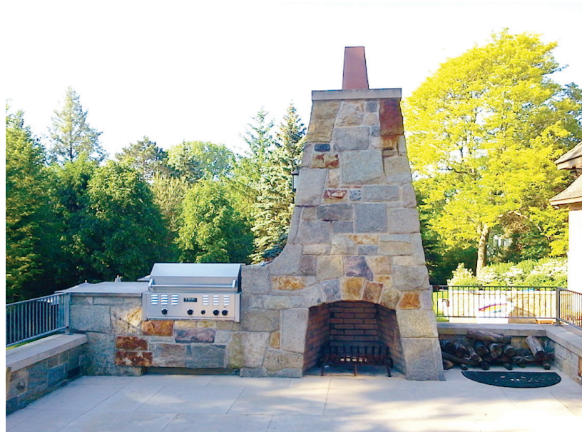
Fireplace and grill combination.