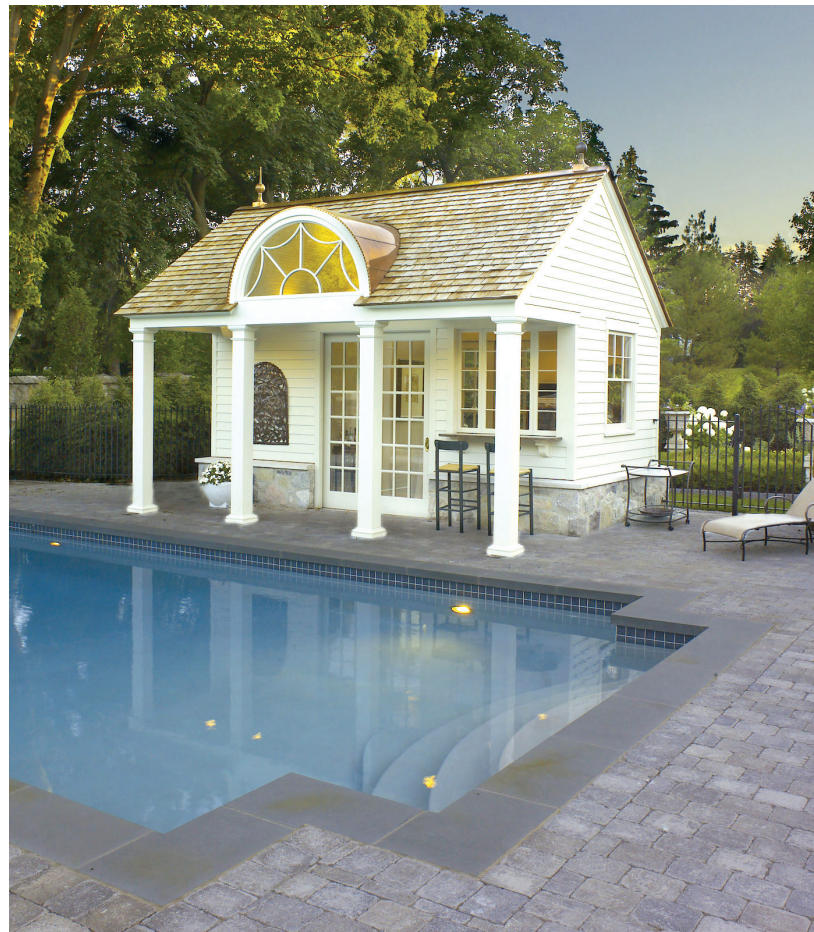
Poolhouse with enclosed kitchen and walkup bar for swimmers, designed by Michael J. Dul & Associates.