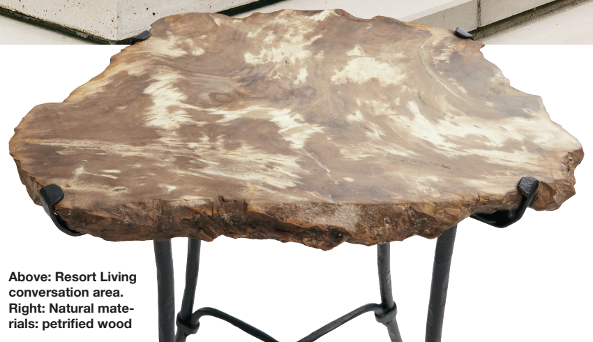
Above: Resort Living conversation area. Right: Natural materials: petrified wood

Gorman's beautiful furniture showrooms in Troy, Novi, Southfield, Shelby Township and Grand Rapids present many styles and carry about 100 different brands, from moderately priced to luxury lines. Lias named the two most popular trends favored by customers as the "New Traditional style" and "Uptown Modern style." Continued on page 92