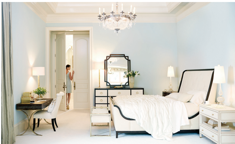
Upholstered high-back bed.