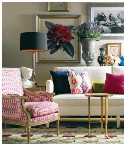
New Traditional Style.