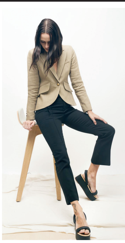
Smythe BLAZER ($595). SHE Bloomfield (248-594-8181) and Grosse Pointe (313-571-3365).