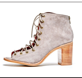
Jeffrey Campbell CORS ($165) in Taupe Suede. Sundance Shoes, West Bloomfield. (248) 737-9059.