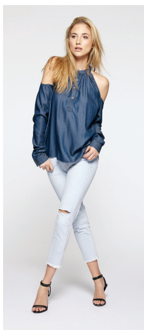
Nicole Miller Artelier DENIM COLD-SHOULDERED TOP ($255). SHE Bloomfield (248-594-8181) and Grosse Pointe (313-571-3365).