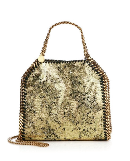
Stella McCartney FALABELLA MINI BABY BELLA METALLIC FAUX SUEDE TOTE ($1,080). Saks Fifth Avenue, Somerset Collection South, Troy. (248) 643-9000; saksfifthavenue.com.