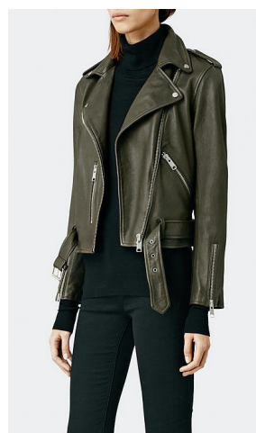
Allsaints BALFERN LEATHER BIKER JACKET ($540) in Dark Army Green. Allsaints.com.