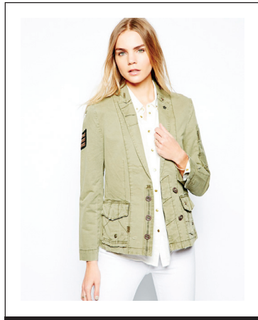
Zadig & Voltaire VIRGINIA GRUNGE JACKET ($398). Rear Ends, West Bloomfield and Bloomfield.