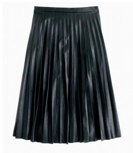
J. Crew FAUX-LEATHER PLEATED MIDI SKIRT ($148). Area J. Crew stores (jcrew.com).