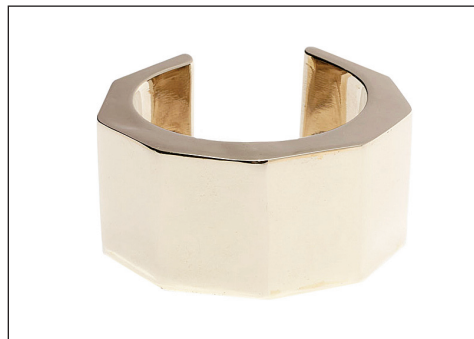
Anndra Neen THUNDERDOME CUFF ($460). Shopbazaar.com.