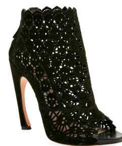
Alexander McQueen SKULL CUTOUT BOOTIE ($1,275). Area Nordstrom stores (nordstrom.com).