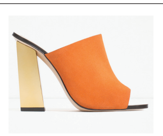
Zara LEATHER SLING-BACK SANDALS ($89.90). Zara.com.