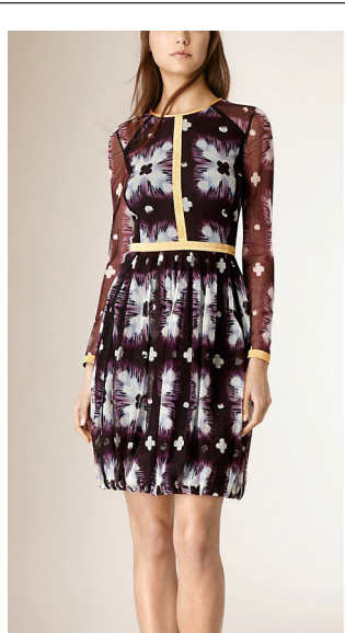
Burberry TIE-DYE PRINT SILK BLEND DRESS ($2,795). Burberry, Somerset Collection South, Troy. (248) 643-8555; burberry.com.