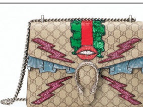
Gucci DIONYSUS GG SUPREME EMBROIDERED BAG ($3,800). Gucci, Somerset Collection South, Troy. (248) 643-7630; gucci.com.