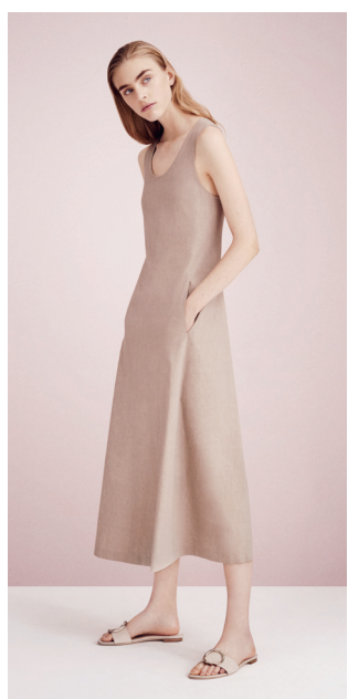
Theory POCKET DRESS (call store for price). Guys n Gals, West Bloomfield. (248) 851-1260.