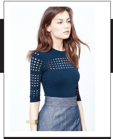
Autumn Cashmere PERFORATED KNIT TOP ($192). Hersh's, West Bloomfield. (248) 626-7776.