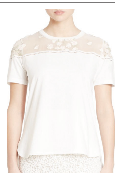
Giambattista Valli SHEER DAISY-YOKE TEE ($750). Saks Fifth Avenue, Somerset Collection South, Troy. (248) 643-9000; saksfifthavenue.com.