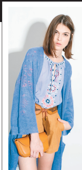
Antik Batik TOP ($231), CARDI ($321) and SHORTS ($172). Guys n Gals, West Bloomfield. (248) 851-1260.