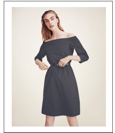
Theory OFF-THE-SHOULDER DRESS ($315). Guys n Gals, West Bloomfield. (248) 851-1260.