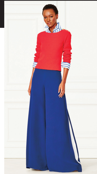
Ralph Lauren BUTTON-SHOULDER SILK SWEATER ($1,190) and ADELE WIDE-LEG PANT ($2,690). Ralph Lauren, Somerset Collection South, Troy. (248) 649-7201; ralphlauren.com.