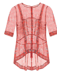
Veronica Beard PAPYRUS PINTUCK CHIFFON PEPLUM TOP ($425). SHE Bloomfield (248-594-8181) and Grosse Pointe (313-571-3365).