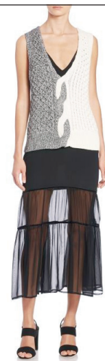
Thakoon CABLE-FRONT COMBO DRESS ($1,050). Saks Fifth Avenue, Somerset Collection South, Troy. (248) 643-9000; saksfifthavenue.com.