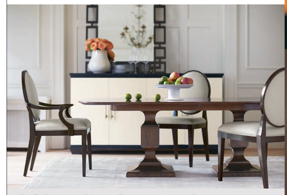
New Traditional in the dining room. Fundamental, uncluttered lines are used with simple woods and organic accessories. Rounded chair backs add interest, and the contrast between vanilla white and darker trim and woods make an original statement different from previous traditional styles.

and decor that fit their personality. Most of the staff at the Gorman's stores are interior designers and can customize a room if you show them what you like. They will even come to your home to consider space, living style and price point.