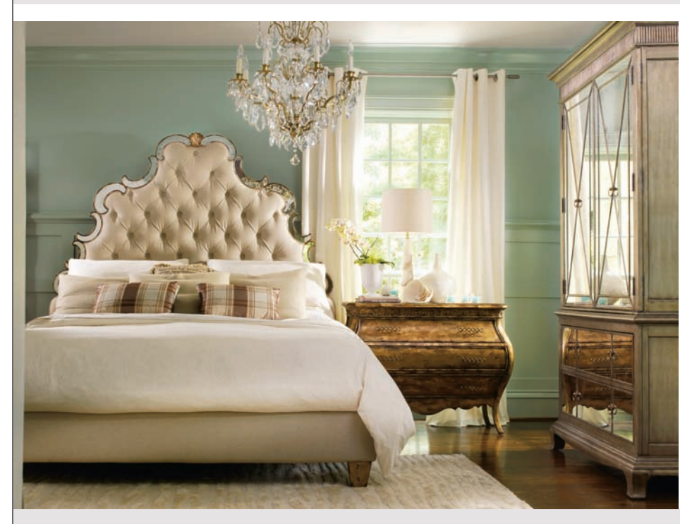
Elegance incorporates antique mirrors and gold-gilded, hand-carved chairs. In this example, an antique carved chest and mirrored glass wardrobe complement the crystal chandelier. The bed's high, tufted backboard of carved wood is also adorned with sparkling jewels. People who throw big parties with extensive guest lists could use this style to tell their story. If Gatsby were starting over in 2016, he'd probably gravitate toward this Elegance style.

Point Market in North Carolina, where she grew up and started her design career], we're seeing lots of velvet this season, but it's cut velvet, often with patterned textures and sophisticated tone-on-tone colors," she adds.