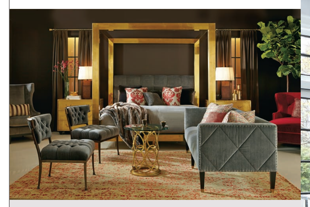
New Traditional in the bedroom. Could this be the bedroom of Mad Men 's Don Draper transplanted to a 2016 movie set? Slate gray walls provide the backdrop for muted, layered tones punctuated with tufting, nailheads and quilting. Textures of velvet, fur and an embroidered-look in pillows and rug complete the look. A traditional canopy bed is transformed into the clean lines of gold-finished metal. The gold tones continue into the room with matching night chests that features drawers outlined in nailheads. The quilted velvet of the headboard and coverlet extend to the tufted chairs and quilted loveseat. An unexpected fretwork table with a glass top centers the casual seating area.