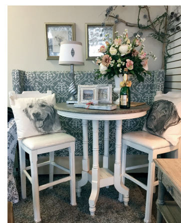
A vignette from Extra Oomph! featuring a headboard covered in fabric.

Embrace your individual lakefront cottage dream, whether you use professional assistance to decorate or enjoy finding your own treasures. The many lakes of Michigan are calling. NS