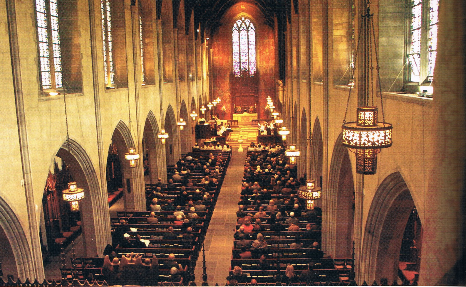
Interior view of Christ Church from balcony.