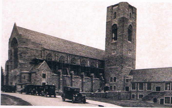
Christ Church Cranbrook circa 1924.