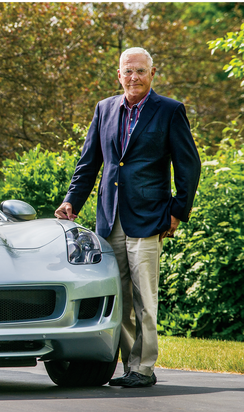
Left: Bob Lutz with his Destino assembled in Auburn Hills, Michigan, by his new automotive company, VLF. Below: A sculpted design even under the hood.

started a new car company now, when he could rest on his legacy, he replied, “It’s fun.” And it’s clear from his laugh and enthusiasm that he’s having the time of his life.